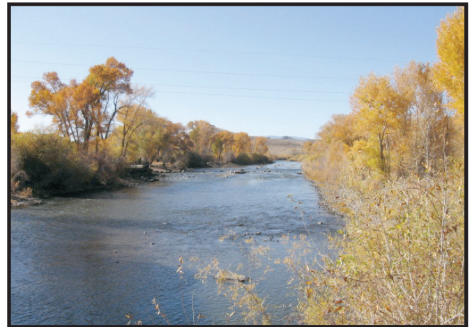
Rio Grande River, Del Norte